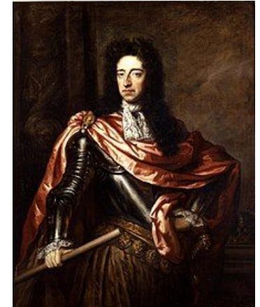
William of Orange