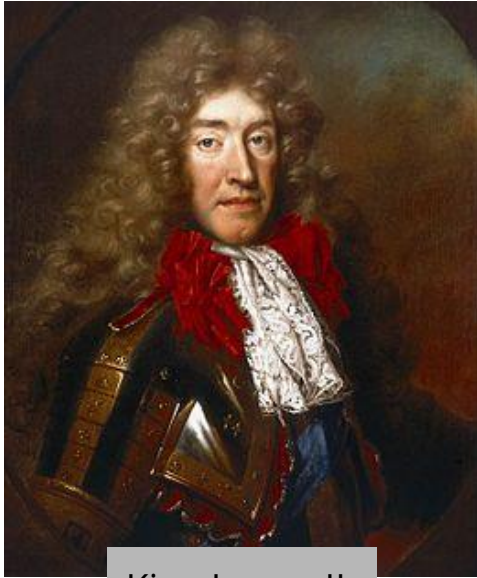
King James II