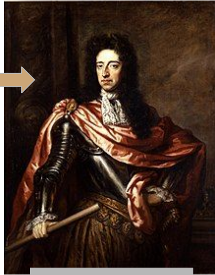
William of Orange