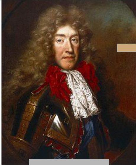
King James II