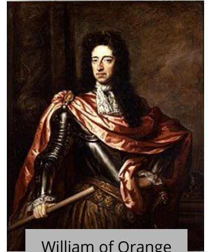
William of Orange