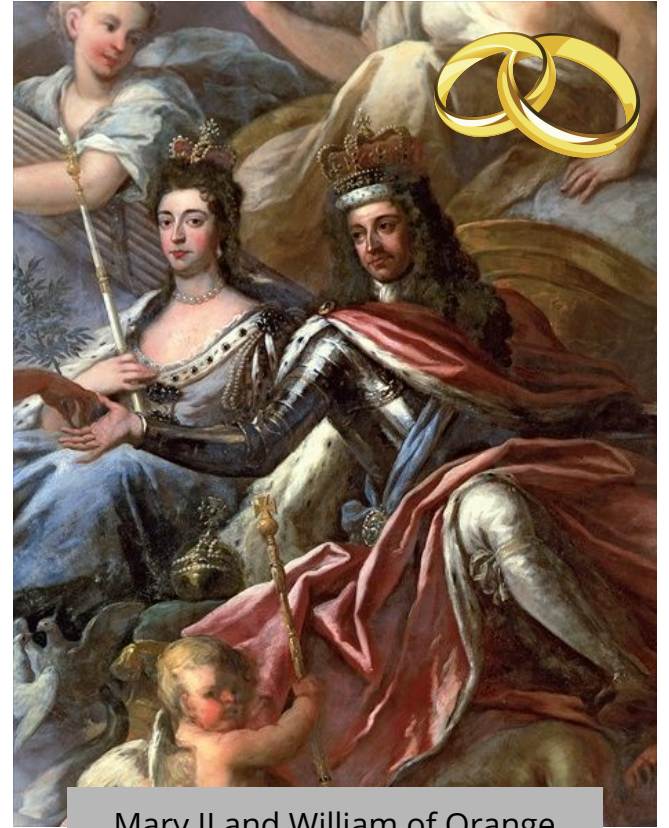
Mary II and William of Orange